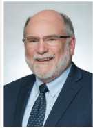
Edwin C. Bull Land Use and Zoning