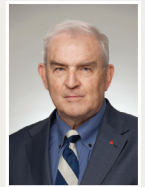
Ian Neale Personal Injury Litigation-Defendants